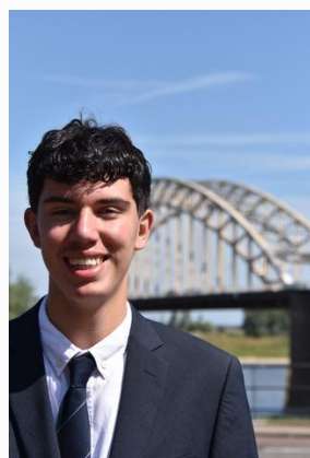
JUULS DEN UIJL